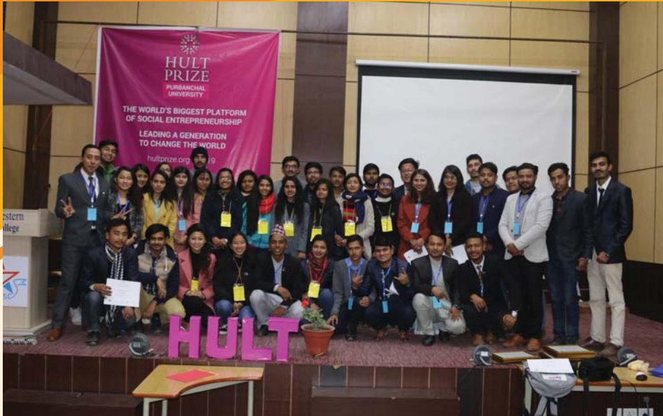
Academic Competition at the International Level