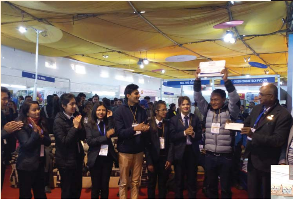
First Position in National Level Hydro Competition

Speech Competition, Add Mad Collage Making, Quiz Master, Elocution, Live Projects, Debate Competition, Discussion on Current Topic, Mock Interview Session, Product Dumb Charade, In House Business Quiz are but few of the most highlighting and also relevant on-going activities. You are in a fun-mode, you learn better, you never forget!