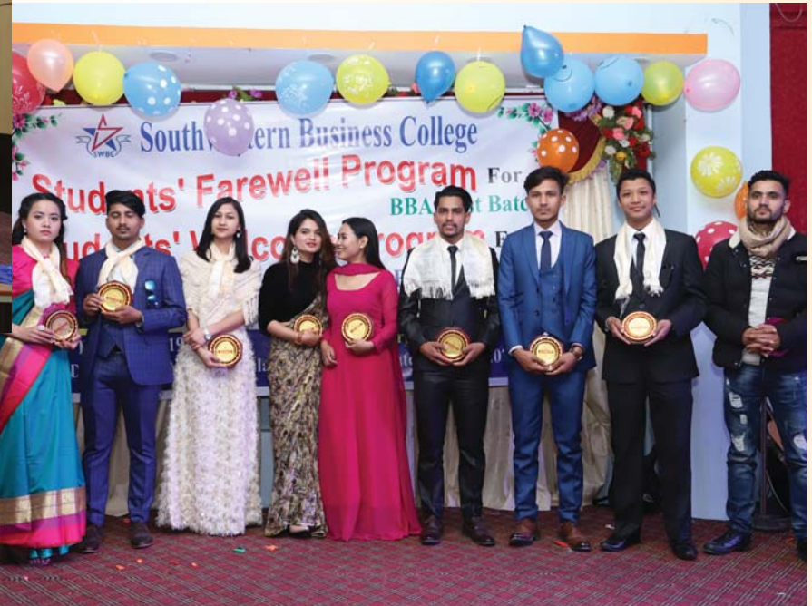
Let talent win !