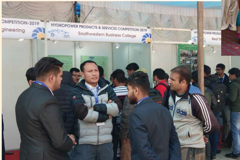
Together everyone achieves...