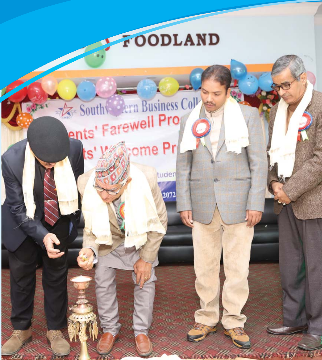
Honouring in style !