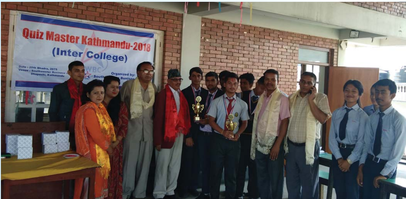
Your work is greatly appreciated...